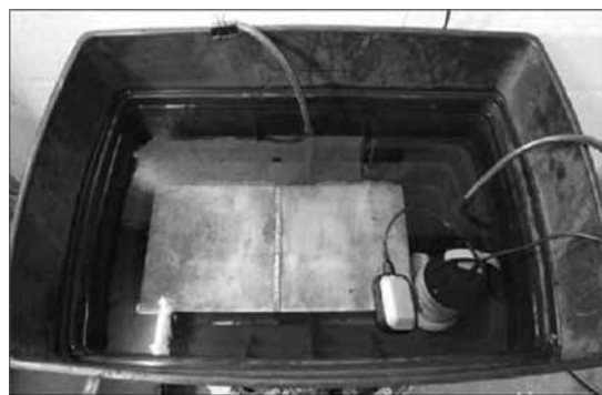
Fig 3: Test tank with submersible pump

Two separate butt-welded steel test plates with certified artificial defects were used. One plate contained six surface breaking non-visible cracks varying in length, between 5 mm and 15 mm on a 600 mm × 300 mm test piece. The other plate contained three surface-breaking non-visible cracks that were 30 mm to 40 mm in length on a 300 mm × 200 mm test plate. Two plates were used to determine whether the size of plate or length of defect (over 5 mm) had any bearing on the test results. None were reported.