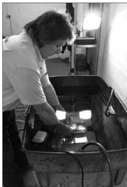
Fig 4: Measuring ambient light prior to MPI