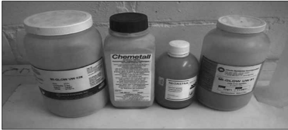
Fig 1: Containerised MPI inks

broadly followed the methodology given in the UK standards (listed in Table 1) adapted for underwater use. The exception was the introduction of increasing white light levels to determine the fluorescent ink sensitivity. Four commercially available inks were selected for the trials, identified in Fig 1 and Table 2.