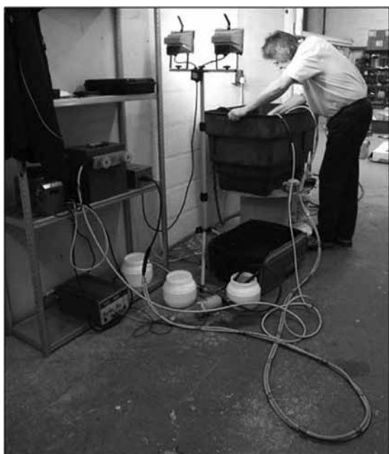
Fig 2: Test facilities

Field Flux (Burmah Castrol) Strips Type 1 were specified to confirm adequate magnetic flux adjacent to the defects in the test plate. The indicator strips contain three milled slots and are manufactured from permeable magnetic steel sandwiched